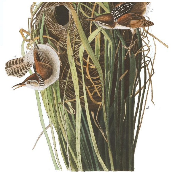
Marsh Wren TROGLODYTES PALUSTRIS (Linn.) Male & Female 2, 3. Nest 1, 4.