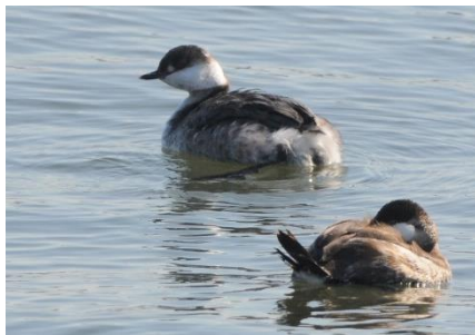
Horned Grebe and a Ruddy Duck