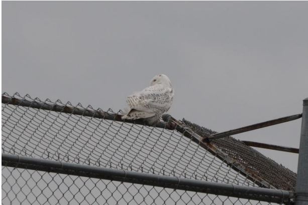
Snowy Owl surveying a baseball diamond.