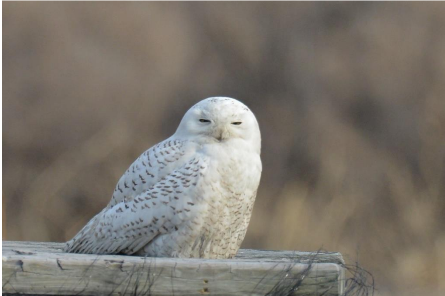
Snowy Owl at Mill Creek Marsh

How far from shore have snowy owls been observed over the Atlantic Ocean?