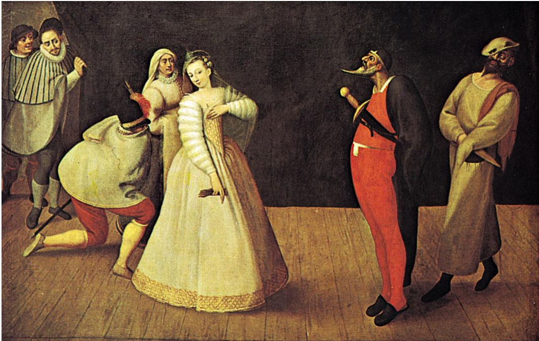
Commedia dell'arte troupe, probably depicting Isabella Andreini and the Compagnia dei Gelosi, oil painting by unknown artist, c. 1580; in the Musée Carnavalet, Paris

Which duck is named for a stock character of the commedia dell'arte?