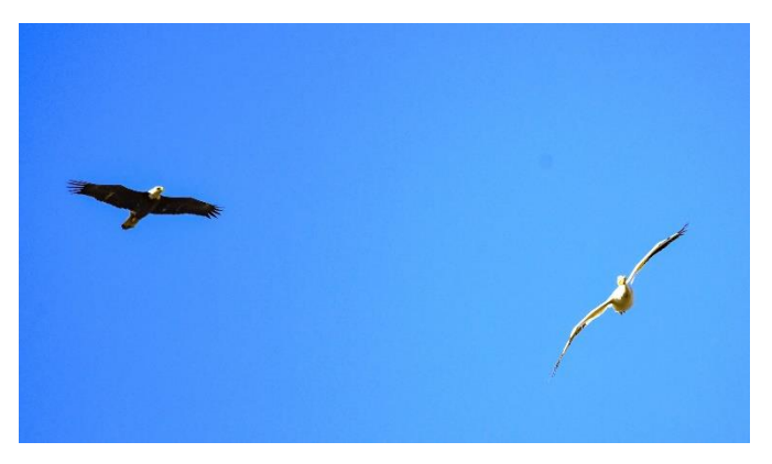
White pelican and bald eagle at Mill Creek Marsh