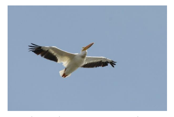
White pelican at DeKorte Park