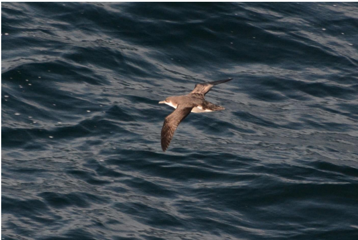
Manx Shearwater Puffinus puffinus