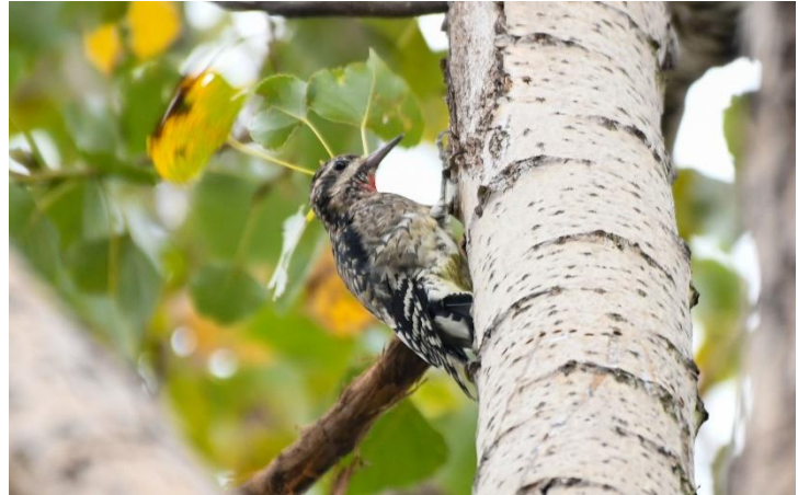
A yellow-bellied sapsucker creating sap wells.