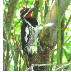
A red-naped sapsucker stripping bark to reach the sap. Broad-tailed hummingbirds will soon arrive to sip as well.